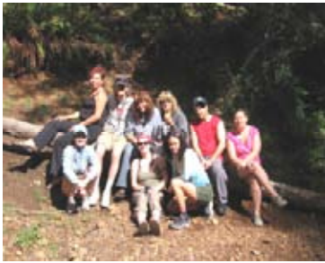
PEERS camping trip to Gordon Bay